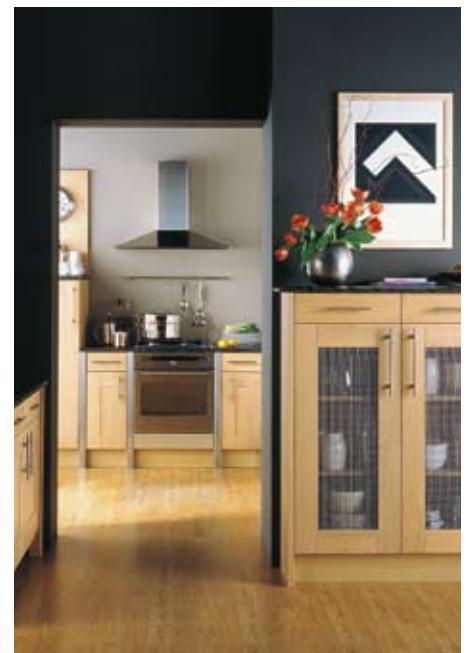
Ideal with cooker hood installations