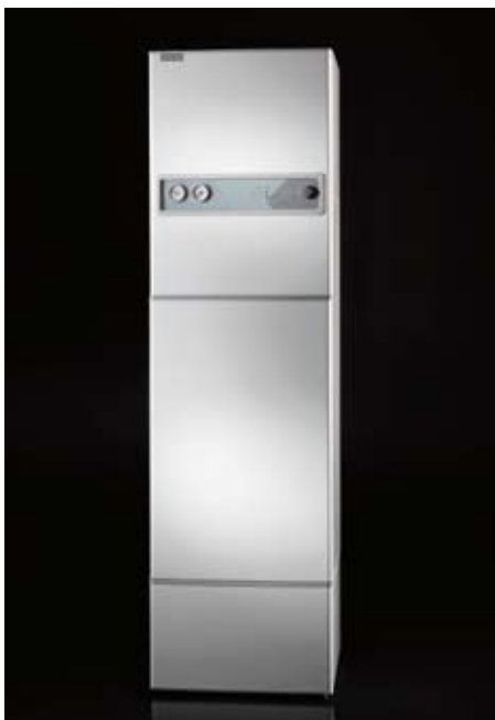
Ideal for use with exhaust air heat pumps

Other applications for this kit include replacement air supply for Mechanical Extract Ventilation (MEV) systems or fossil fuel burning appliances, as an alternative to conventional airbricks.